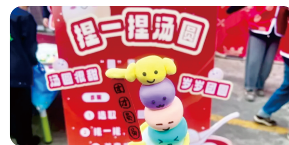
Kneading Clay Tangyuan — Boundless Creativity

Lanterns hung high, each concealing riddles that tested the mind.