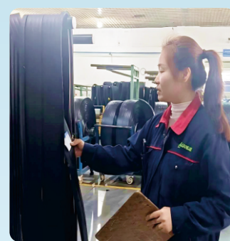
▲ the Quality Department recently organized a practical operation examination on flat wrapping for core administrative personnel from various modules.