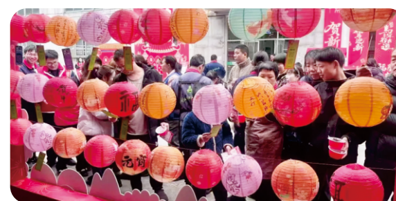
Solving Lantern Riddles — A Gallop of Wit and Wisdom

With festive lanterns and colorful decorations, laughter and joy filled the air. The intellectual challenge of solving lantern riddles, the sweet warmth of tasting tangyuan (sweet glutinous rice balls), the burst of creativity in kneading clay, the fun competition of picking up tangyuan with chopsticks, and the hopeful wishes of tossing for good luck — all these activities perfectly blended the vigorous vitality of the Horse Year with the reunion atmosphere of the Lantern Festival, leaving employees with sweet, warm, and vibrant memories. This unique warmth belonging to us Sanlux people is even sweeter and warmer than the tangyuan themselves.