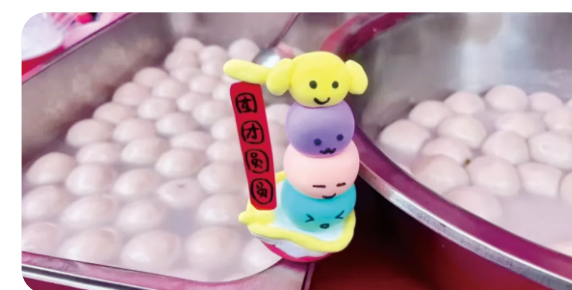
Tasting Tangyuan — Sweet Warmth Entering the Heart

Not content with just being "foodies," everyone transformed into "little craftspeople!"