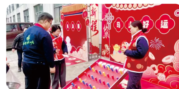
Tangyuan Competition — The Joy of the Chase

The ceremonial feel of the Lantern Festival is forever found in steaming bowls of tangyuan.