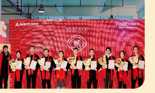
▲Innovation Breakthrough Award