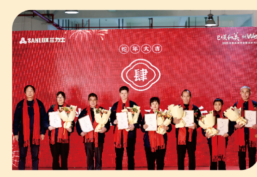
▲Lean Production Pioneer