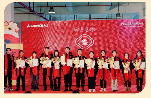
▲Quality Guardian Award